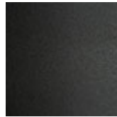
GFM69 graphit gaufriert