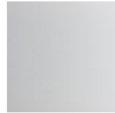
GFM71 weiss gaufriert