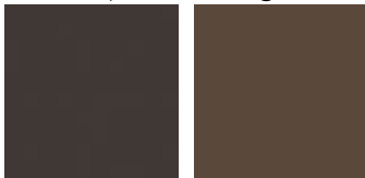
LM21 London grau Fenix