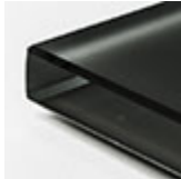
glas extra hell geätzt schwarz lackiert