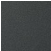
GF69 graphite gaufriert