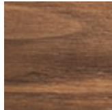
NC nussbaum canaletto