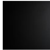
OP17 matt schwarz