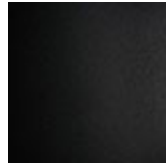
GFM73 schwarz gaufriert