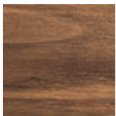
NC nussbaum canaletto