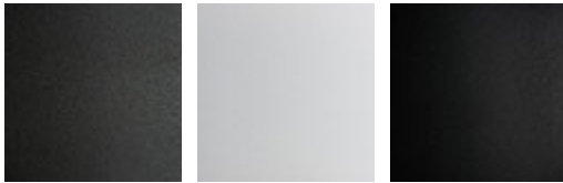
GFM69 graphit gaufriert