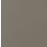
GF30 grey gaufriert