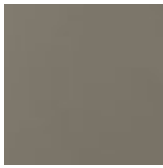
GF30 grey gaufriert