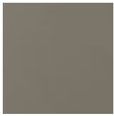
GF30 grey gaufriert