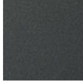
GF69 graphite gaufriert