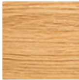
RN farbe natur