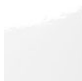
L7 weiß glänzend lackiert