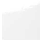
L7 weiß glänzend lackiert