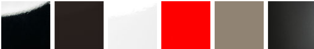
L3 schwarz glaenzend lackiert