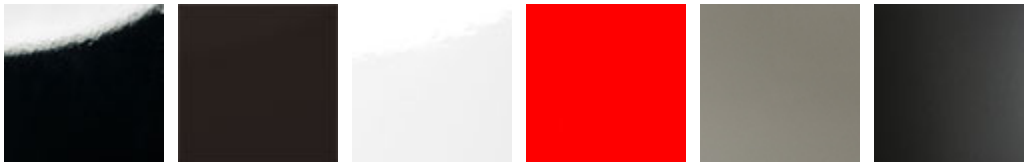
L3 schwarz glaenzend lackiert