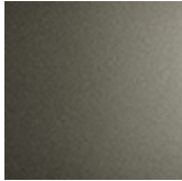
GFM11 titan gaufriert