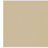
97 PANNA Naehte BEIGE