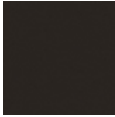
891 TESTA DI MORO