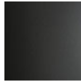
OP69 matt graphite