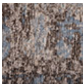
baumwolle und chenille Radja