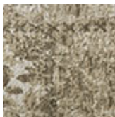
baumwolle und chenille Jaipur