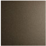
GFM11 titan gaufriert