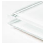
glas extra hell geätzt weiß lackiert