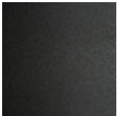
GFM69 graphit gaufriert