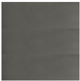
OPO lackiert trasparent