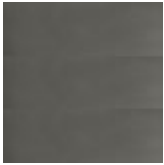
OPO lackiert trasparent