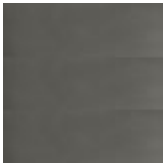
OP0 lackiert trasparent