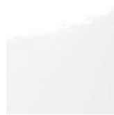
L7 weiß glaenzend lackiert