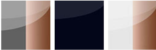
Grau - Bronze