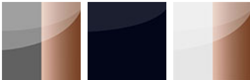
Grau - Bronze