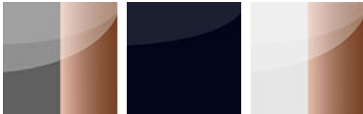
Grau - Bronze