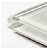
oyster extra hell