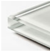
oyster extra hell