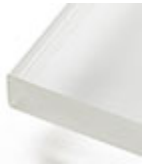
extra hell weiß