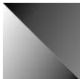
extra hell graphit