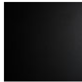
OP17 matt schwarz