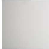
OP71 matt weiß