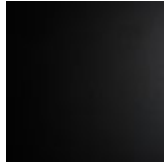
OP17 matt schwarz