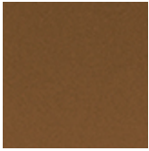
GF15 bronze gaufriert