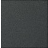
GF69 graphite gaufriert