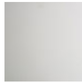
OP71 matt weiß