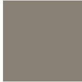
OP30 matt grey