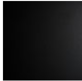
OP17 matt schwarz