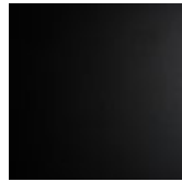
OP17 matt schwarz