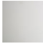
OP71 matt weiß