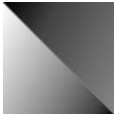
extra hell graphit