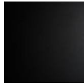
OP17 matt schwarz