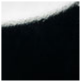
L3 schwarz glaenzend lackiert