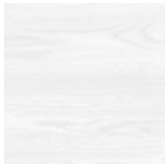
fr71 offenporig lackiert weiß matt