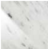
BC weiß Carrara