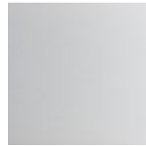
GFM71 weiss gaufriert