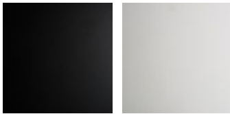
OP17 matt schwarz OP71 matt weiß