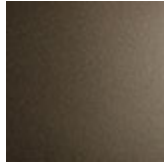
GF11 titan gaufriert