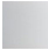
GFM71 weiss gaufriert