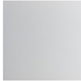
GM71 weiss gaufriert