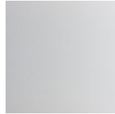
GM71 weiss gaufriert