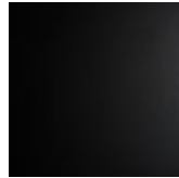
0P17 matt schwarz