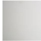
0P71 matt weiß