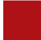
OP89 rot corsa