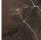
EBO matt Ebona