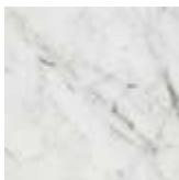
BCO weiß Carrara matt