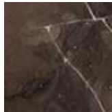
EBO matt Ebano