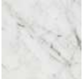
BCO weiß Carrara matt