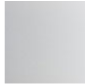
GFM71 weiss gaufriert