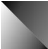
extra hell facettiert