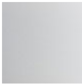
GFM71 weiss gaufriert