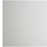
OP71 matt weiß