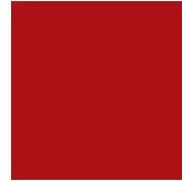
OP69 rot corsa