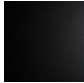
OP17 matt schwarz