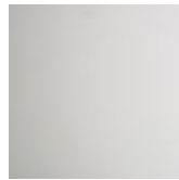
OP71 matt weiß