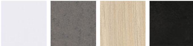
LM01 matt weiß