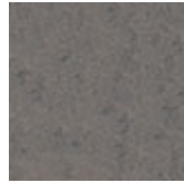
LM03 grau porphyr