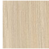
LM04 ulme weiß