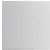
GFM71 weiss gaufriert