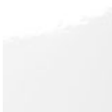
L7 weiß glaenzend lackiert