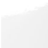
L7 weiß glaenzend lackiert