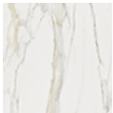
OD05 matt Golden Calacatta