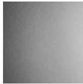
14 silber met