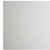
OP71 matt weiß