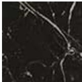
NM schwarz Marquinia