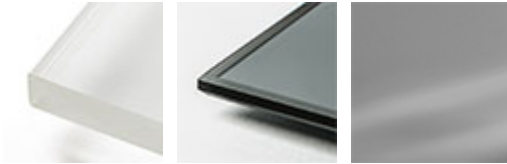
extra hell weiß