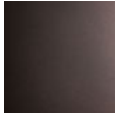
15 satiniert bronze