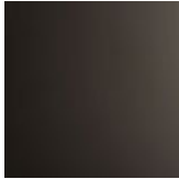
06 schwarz chrom